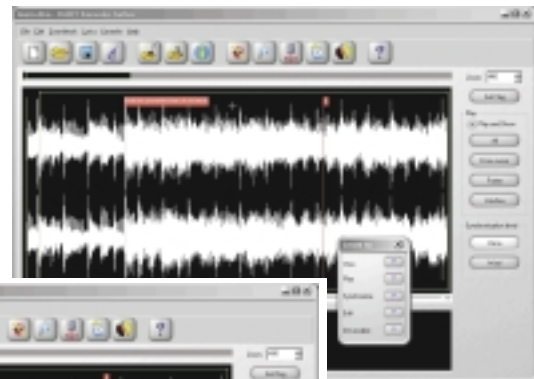
Pop-up guide makes Karaoke easy